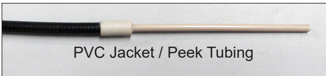
PVC Jacket / Peek Tubing