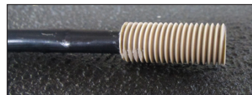
Peek Tip Threaded