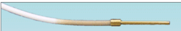
PTFE Jacket / Brass Tip